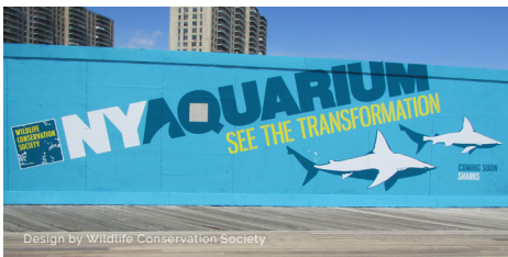
Design by Wildlife Conservation Society